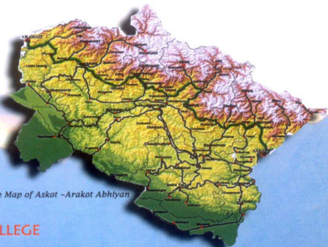
Route Map of Askot -Arakot Abhiyan